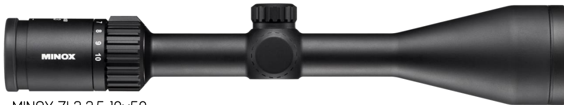
MINOX ZL3 3.5-10x50