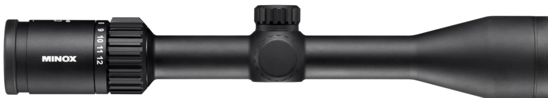
MINOX ZL3 4-12x40