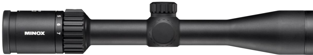
MINOX ZL3 2-7x35